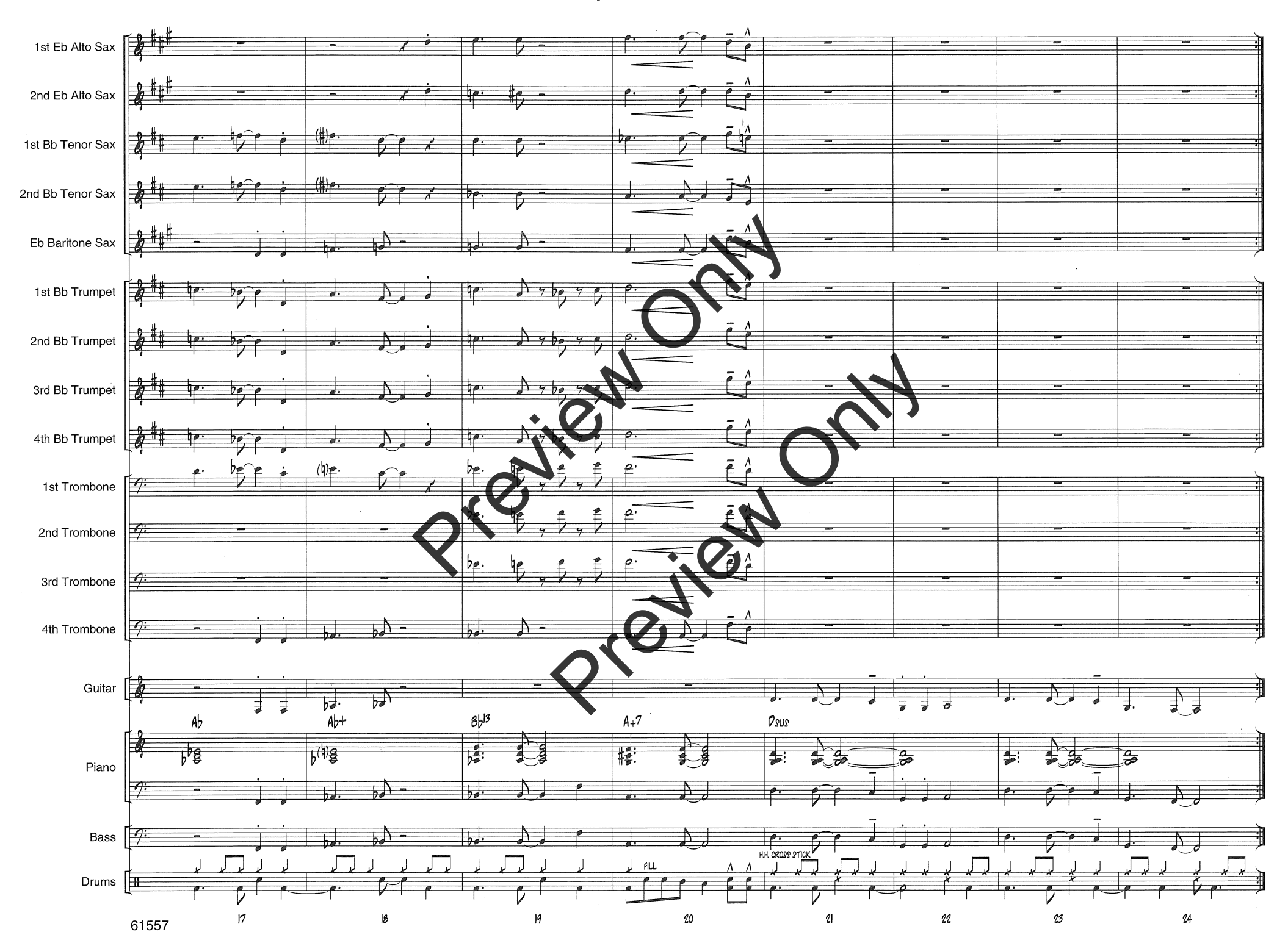
Nye Time - 3